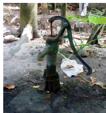
Statement 4.10: Percentage distribution of principal source of drinking water

4.6.3 Form Statement 4.10 below, it is clear that, for houses in the sea shore area, principal source of drinking water is piped-water/public tap. In midland area 81% of the houses use well water for drinking purpose. Apart from the identified principal sources, some other common types were identified in some Panchayaths. e.g.: In some Panchayaths of Thrissur district, a type of filter pipe, locally known as champ pipe, just 3 to 4 meters deep from the ground fitted with either motor or hand pump.